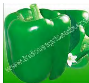
Sweet Papper Seeds