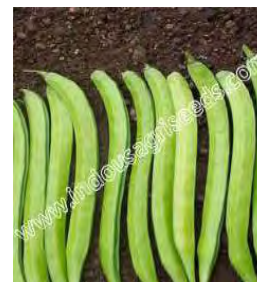
Cluster Bean Seeds