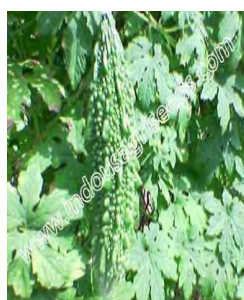
Bitter Gourd Seeds